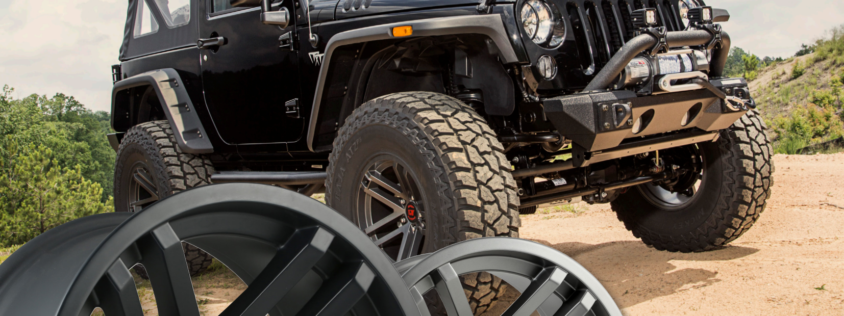
Satin Black 15303.90